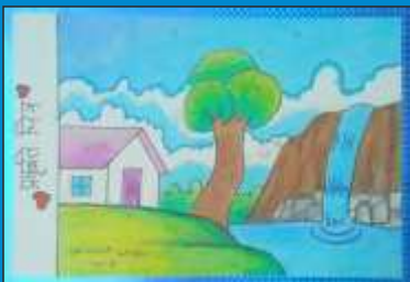
Bhoomika Goyal, IX-B